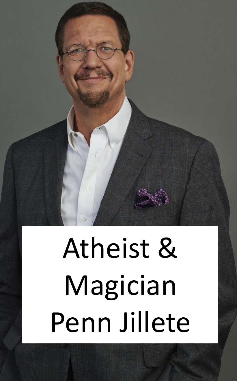
Atheist & Magician Penn Jillete

“I mean, if I believed, beyond the shadow of a doubt, that a truck was coming at you, and you didn’t believe that truck was bearing down on you, there is a certain point where I tackle you. And this [sharing the Gospel] is more important than that [it being awkward].”