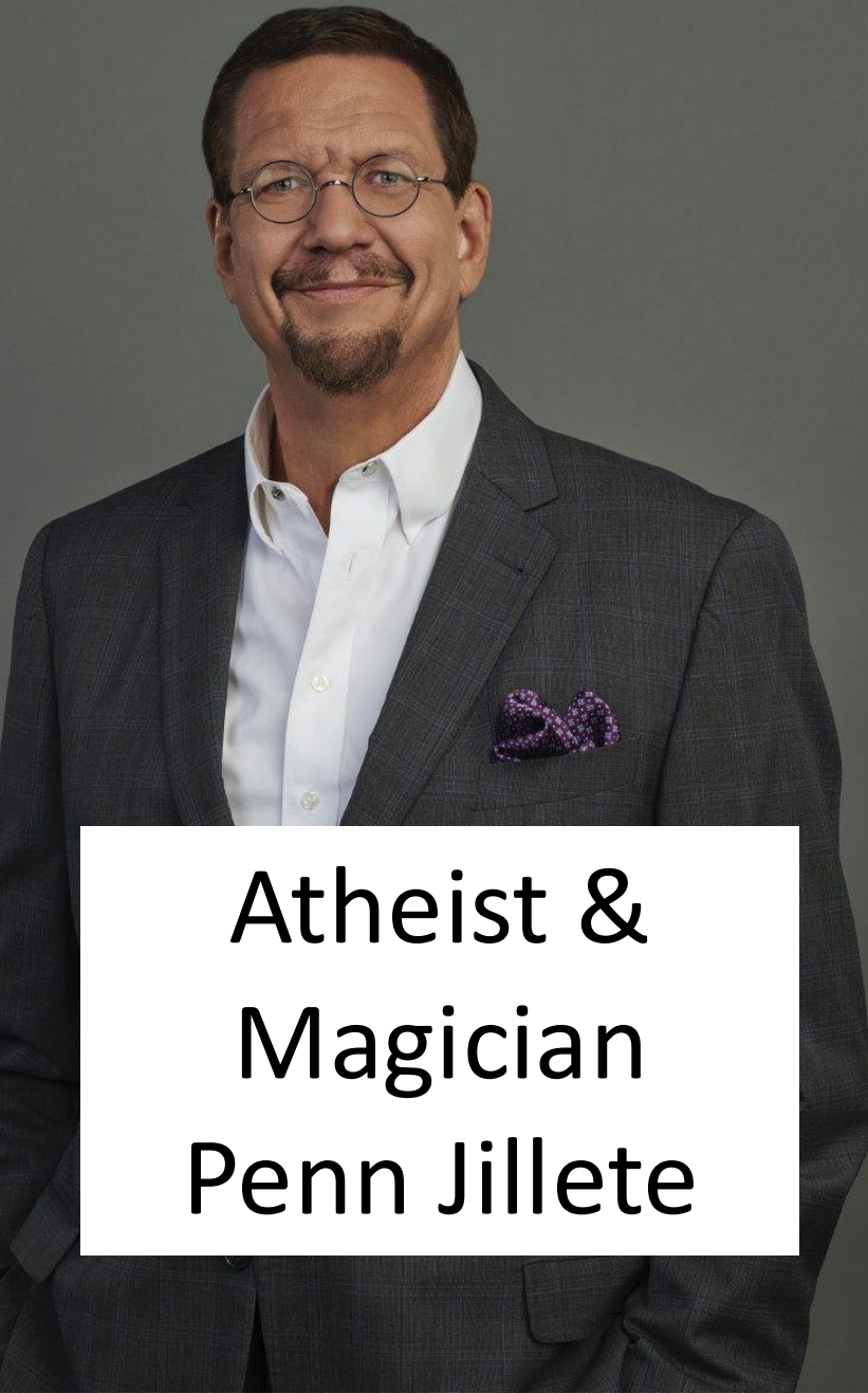
Atheist & Magician Penn Jillette

“If you believe that there’s a heaven and a hell, and people could be going to hell or not getting eternal life, and you think that it’s not really worth telling them this because it would make it socially awkward ... How much do you have to hate somebody to believe everlasting life is possible and not tell them that?”